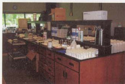
Typical laboratory bench with samples ready for analysis.

Prior to implementing an automated information management system, the laboratory used a manual method of managing laboratory information. Raw data was maintained in paper logbooks or entered into Microsoft Excel spreadsheets and reports were often generated in Microsoft Word. While