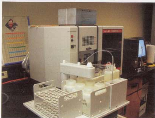
One of the Varian Spectra AA instruments that was interfaced with Sample Master® Pro LIMS.